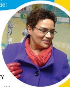
Poet Jackie Kay MBE performing in the FURD library