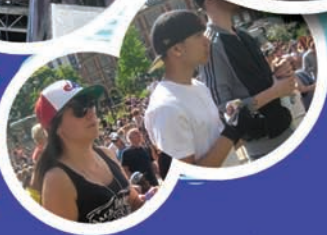
Photos from Tramlines Music Festival 2012

“ Sound Kickers has helped me develop as a guitar player, I'd never played a live gig before I came here and the support from people at the project gave me the confidence to do it ”