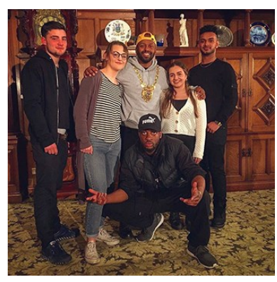
Hive young writers filming 'Britishness' with Lord Mayor Magid Magid.

We continue to offer public access to a huge selection of resources reflecting our areas of work through our Resources and Information Centre, including our website, exhibitions, comics, research, books and films—see Resources | FURD |.